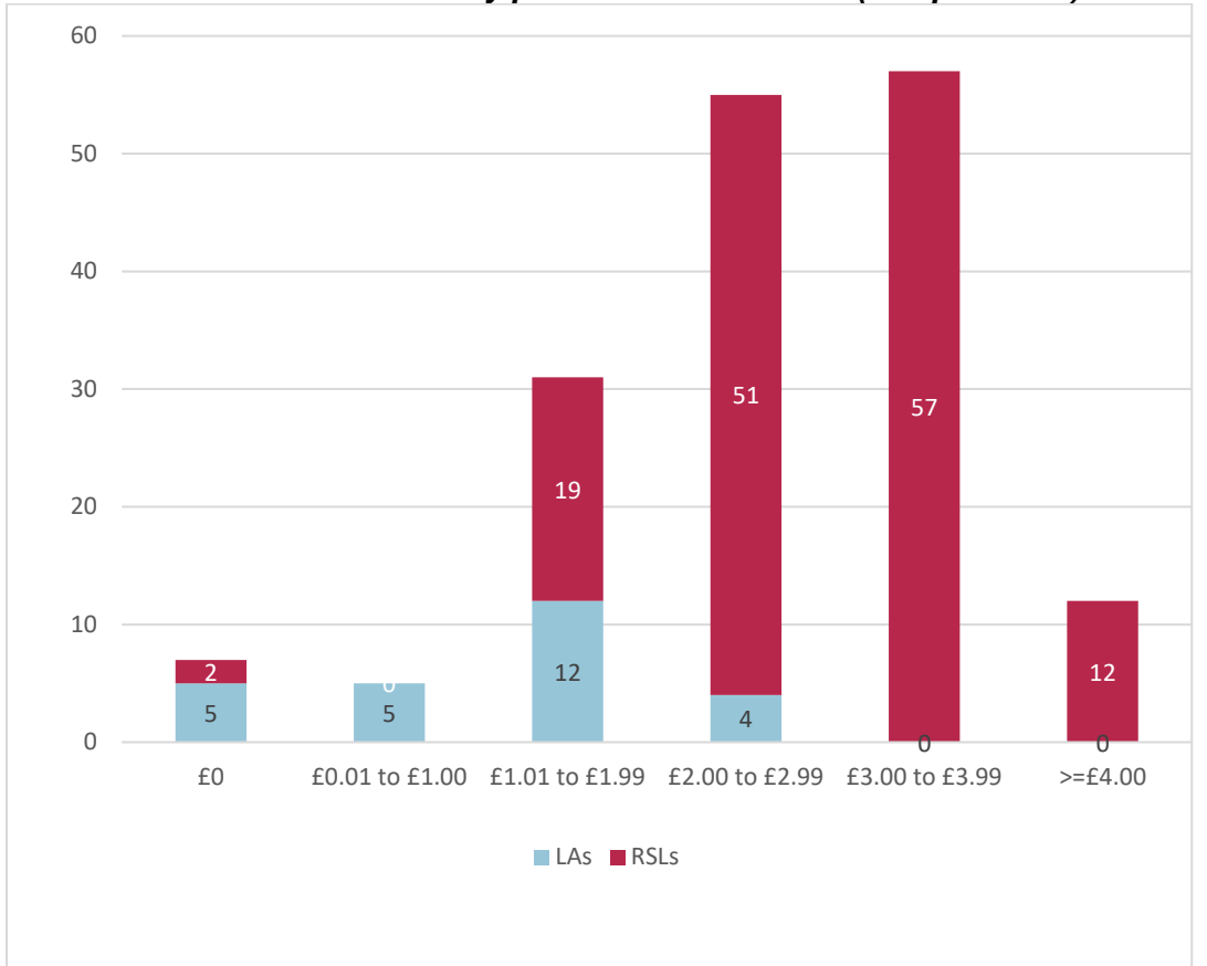
Chart 3: Number of landlords by planned rent increase (in £ per week) 2022-23